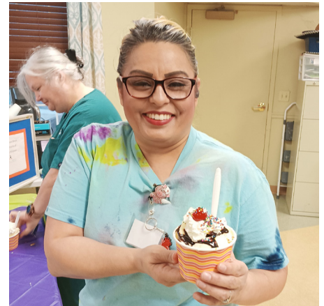
Cimarron Place Celebrates Nurses Week 3