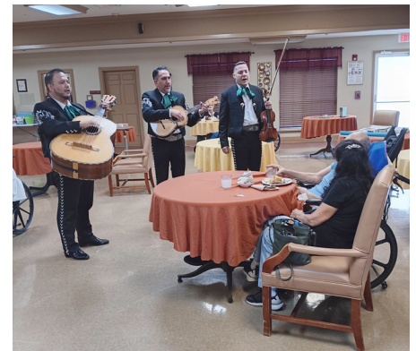
Residents Celebrate Cinco de Mayo with Mariachi